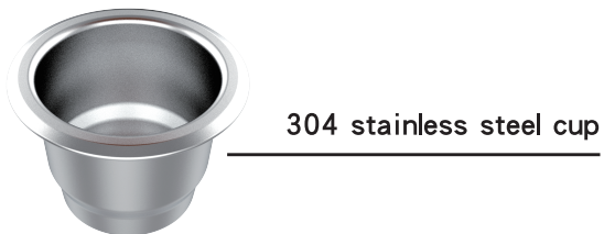
304 stainless steel cup